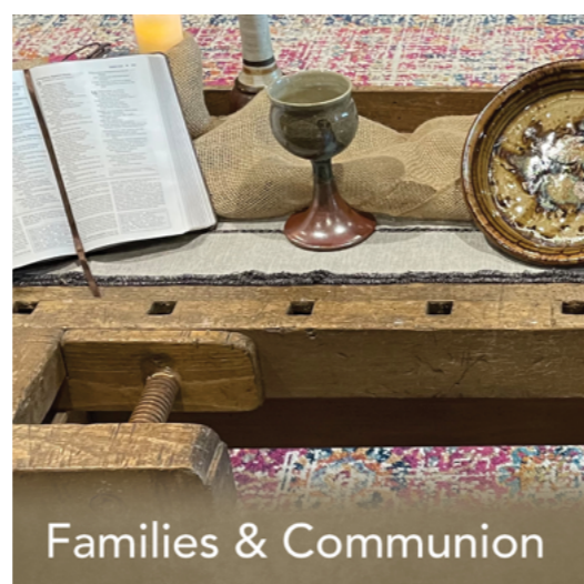
Families & Communion

The true measure of our lives will be the length and strength of the heart-string that ran out from our center into the lives of others, helping them to soar.